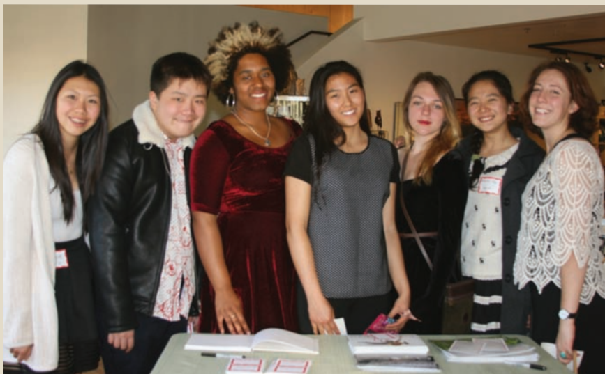
Midland students celebrate the showing of their artwork in the Flora and Fauna exhibit at the Wildling Museum in Solvang