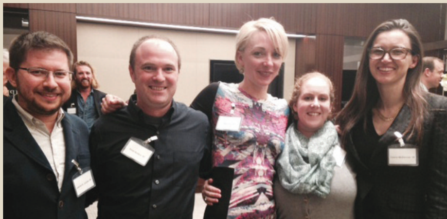
Midland alums gather atop Grand Central Station at the first-ever New York City Midland gathering