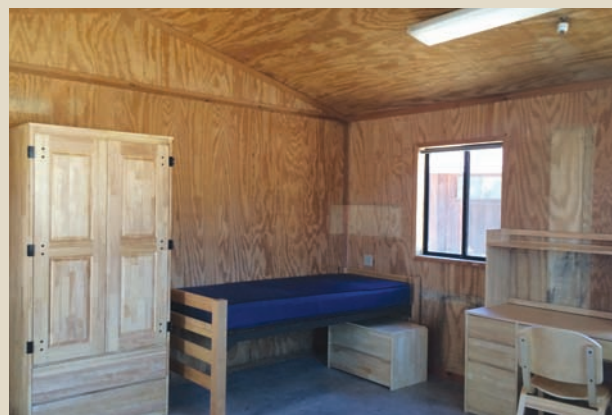
New furnishings in a student cabin