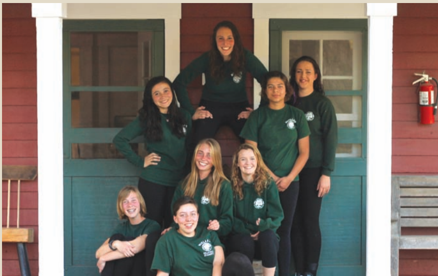
Midland students sport their Mighty Oak pride