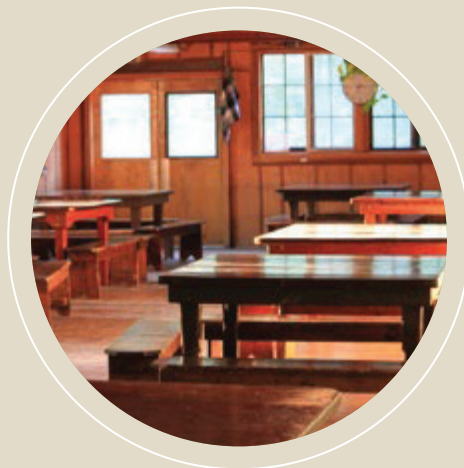
Floors and tables were refinished in Stillman Hall

For more information or to learn about the priority needs for the Campus Plan, please contact Ed Carpenter '64 at ed@edcarpenter.net