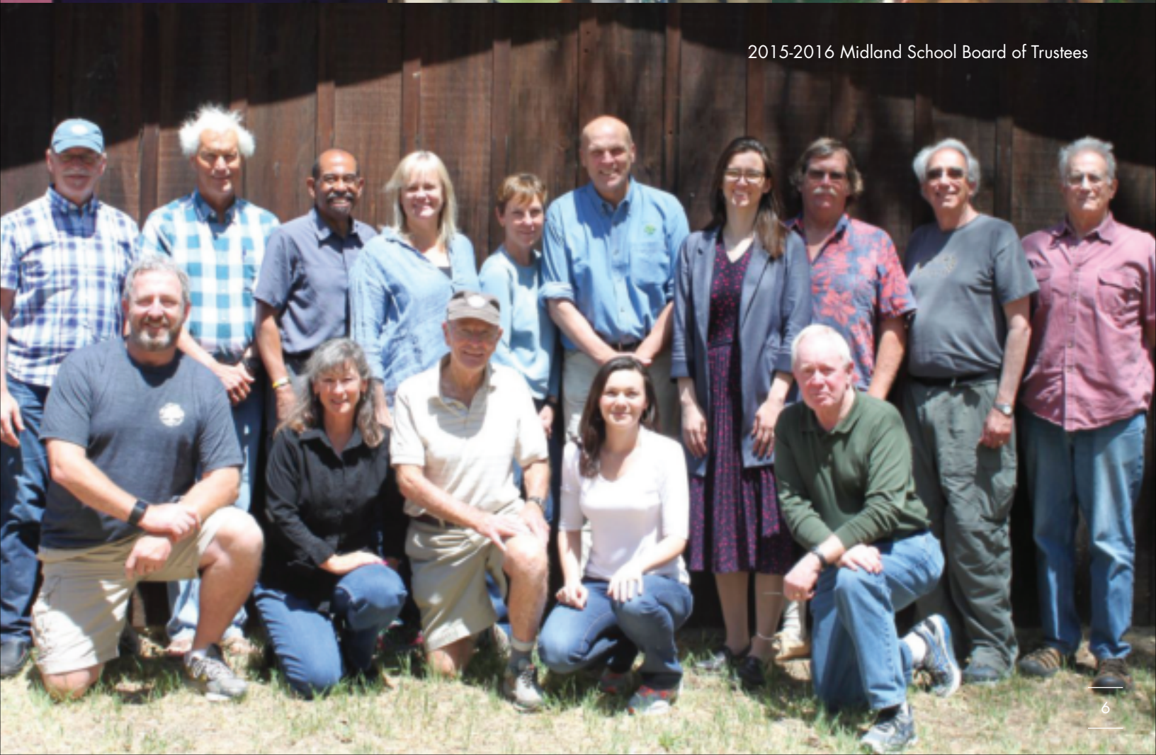
2015-2016 Midland School Board of Trustees